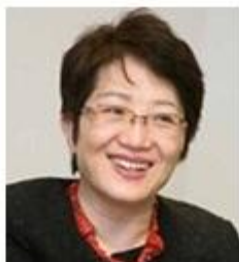
Chairman of Community Support Committee, Deputy Director General, IDEAS Institute, III