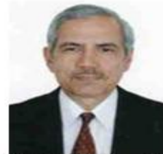
UN/CEFACT Vice Chair & Controller of Certifying Authorities, Ministry of Communications and Information Technology