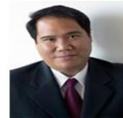
Chairman of Business Domain Committee, Deputy Director of ETDA Electronic Transactions Development Agency