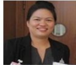
New UN/CEFACT Rapporteur for Asia and the Pacific