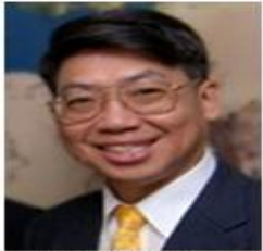
AFACT Chair Elected HoD of Taiwan Executive Vice President, Institute for Information Industry