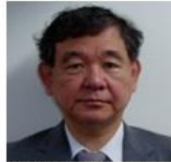
AFACT Vice Chair HoD of Japan Director, Japan Association for Simplification of International Trade Procedures (JASTPRO)