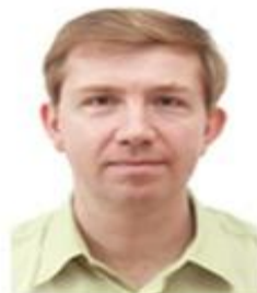
UNESCAP Representative Chief, Trade Facilitation Unit - Trade and Investment Division