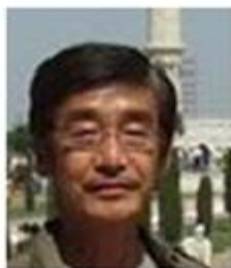
Chairman of Technology and Methodology Committee, Supply Chain Information Platform Study Group