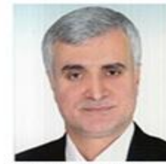
HoD of I.R.Iran President of Iran Center for eCommerce Development, Ministry of Industry, Mine and Trade, I. R.Iran