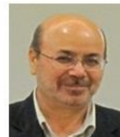
General Secretariat of AFACT