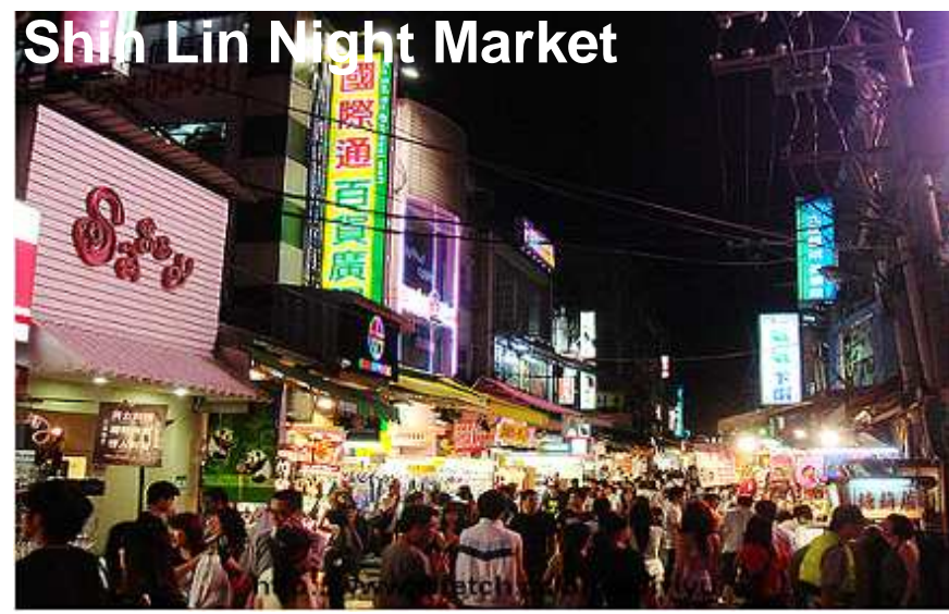
Shin Lin Night Market